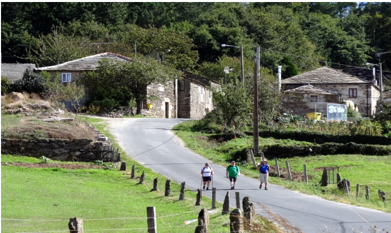
video clip on CAMINO DE SANTIAGO

More info, https://www.facebook.com/media/set/?